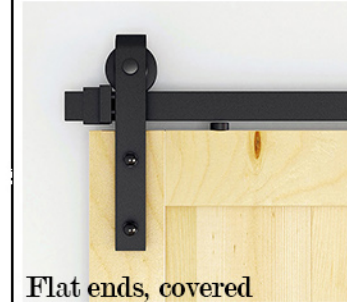
Flat ends, covered